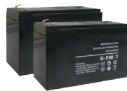
Optimized battery configuration 7Ah/9Ah (12V)