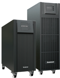
Battery cabinet (Optional)