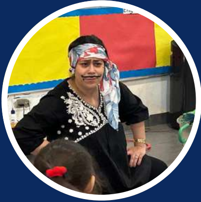
Teacher in-role: (Garhi Aayi- Aaye Aam)