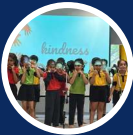
Celebrating Our School core Values

Director Principal Shiv Nadar School, Faridabad